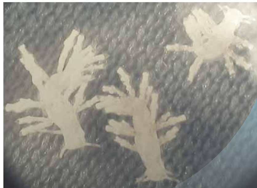
Monti eating nudibranch