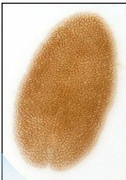
Acro eating flat worm

(Photos are stolen from the web with credit due to their creators)