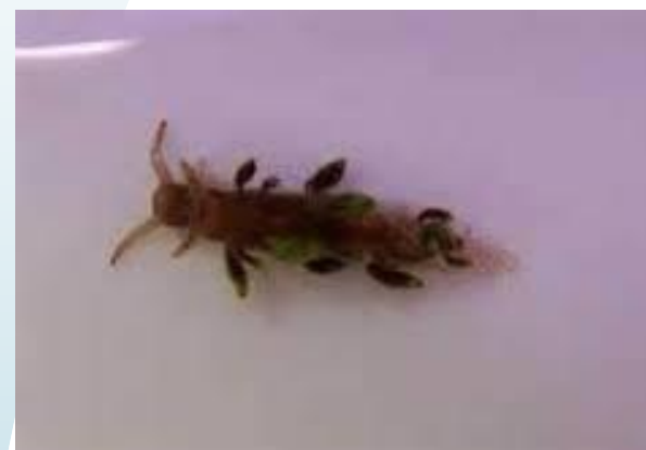
Zoa eating nudibranch