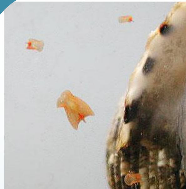
Red annoying flat worms